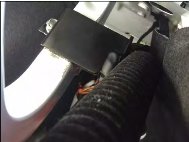
11. Install rear brace rod.