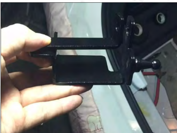
7. Schematic diagram of the position of the bracket. (Note: The bracket with the ball head is on the "7" shaped bracket. The photo position is only for better display.)