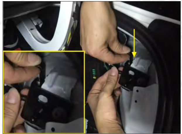
4. Insert our "7" shaped bracket into the hole and install it behind the bracket (Pictured).