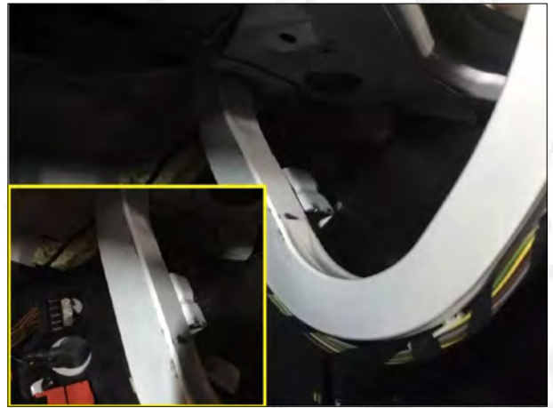
6. After installing the bracket, find the position as shown in figure.