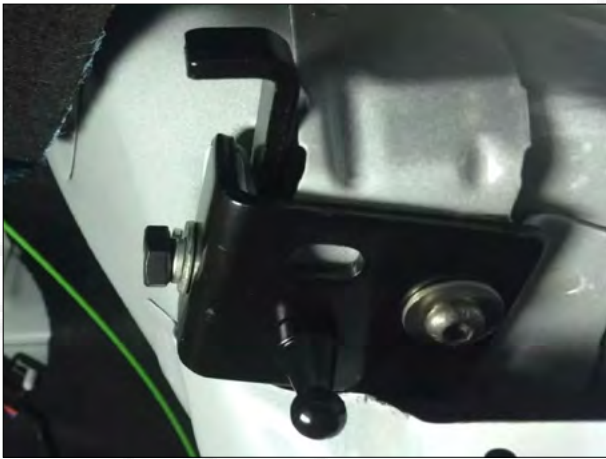
5. Front bracket installation completed.