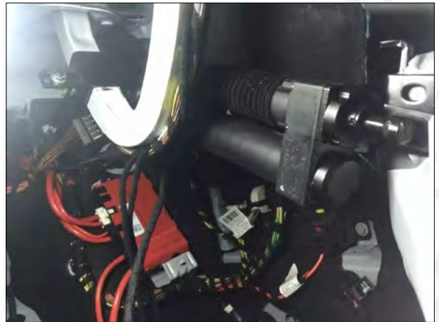
12. Brace rod installation completed schematic.