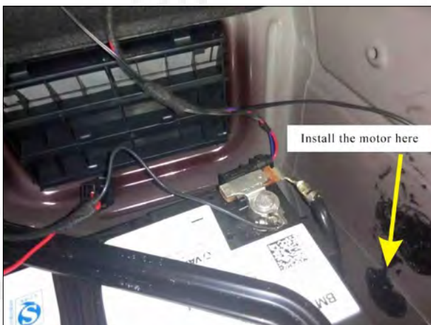
17. Motor installation position. Fixed with our 3M paster.