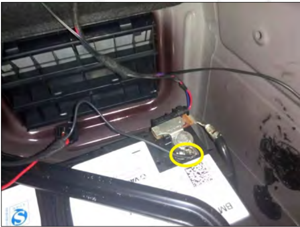
15. Opposite to the positive side of the power supply is the negative side of the power supply (As shown in the figure). Connecting the grounding wire.