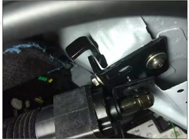
10. Install the front of the brace rod.