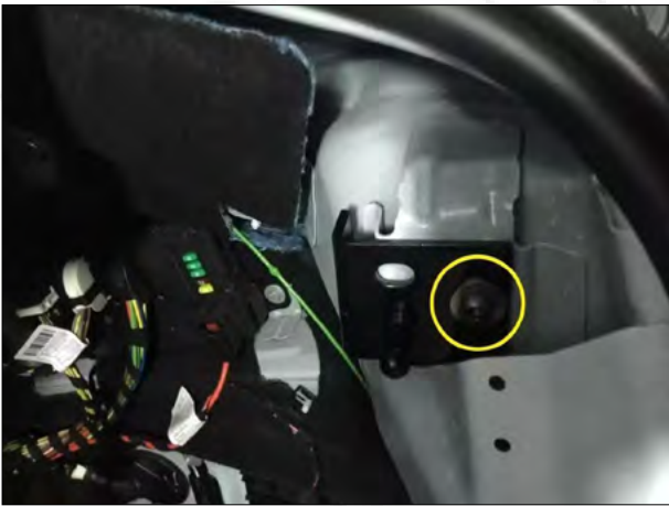
3. Install the bracket and fix it with the screws.