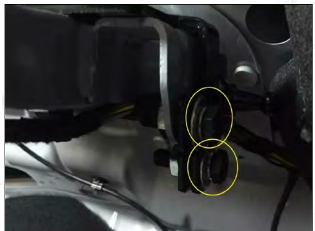
8. Screw the bracket to the bracket position on the side of of the ball head.