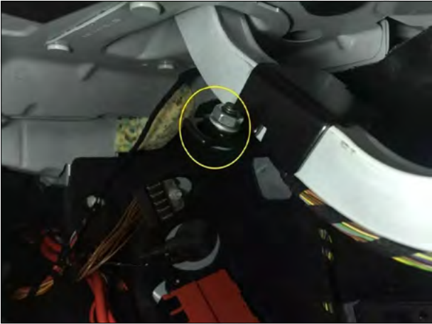
9. Fix the bracket with screws as shown in the picture.