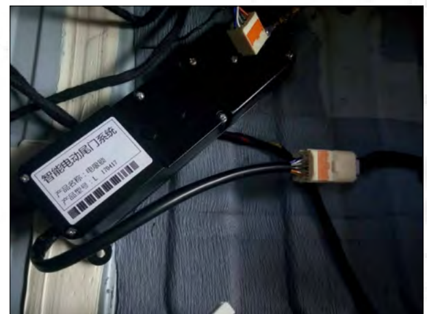
18. Connect the plug of our electric suction cable with the motor socket.