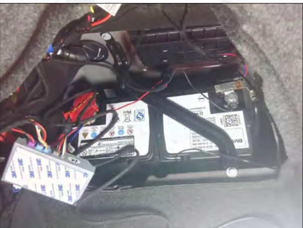
13. Find the battery under the brace rod.