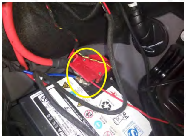
14. Our power supply is connected to the positive.